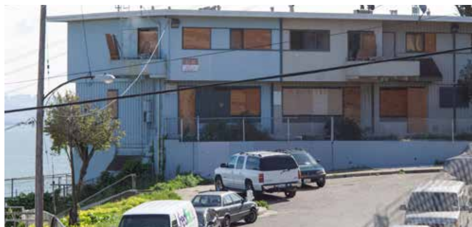
Public housing not yet demolished.