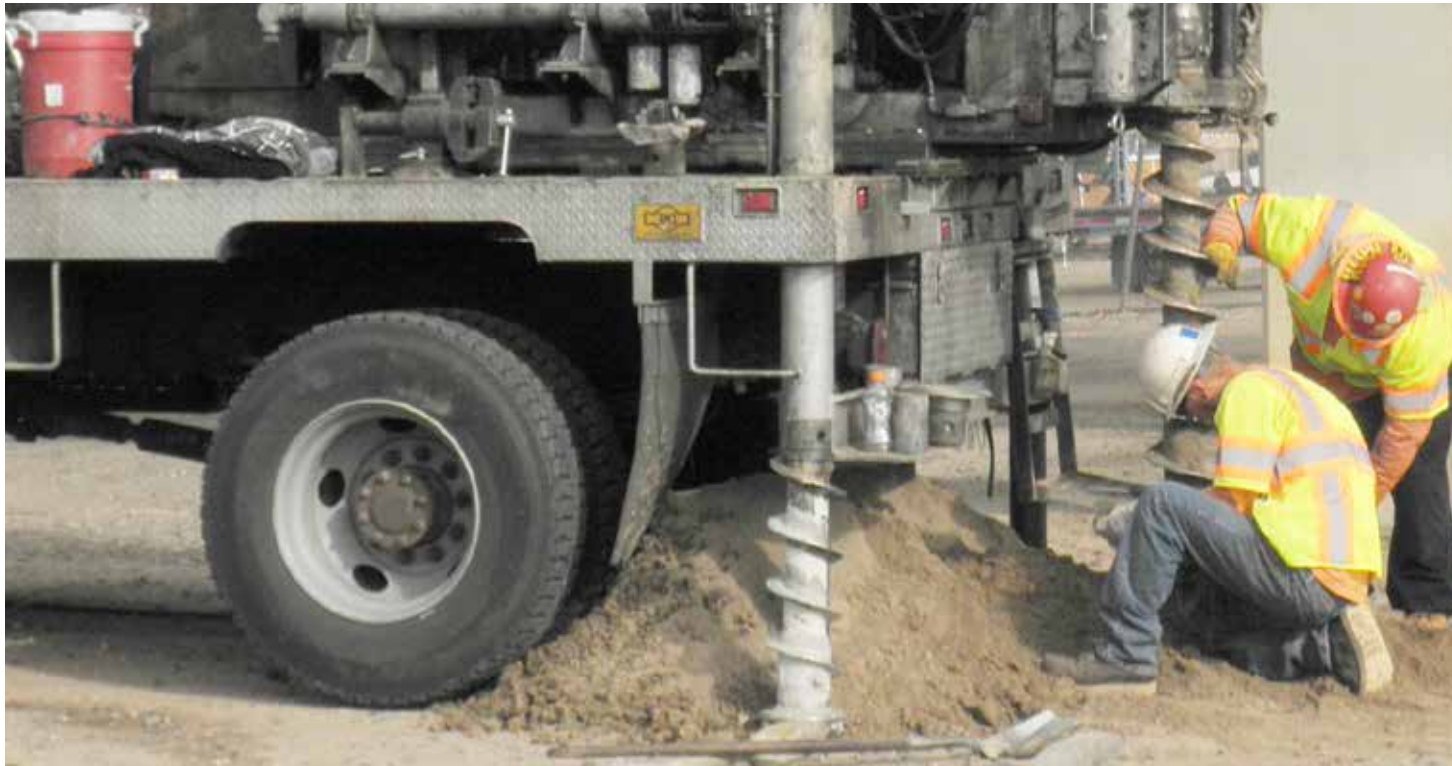
California High-Speed Rail Authority workers busy out in the field.