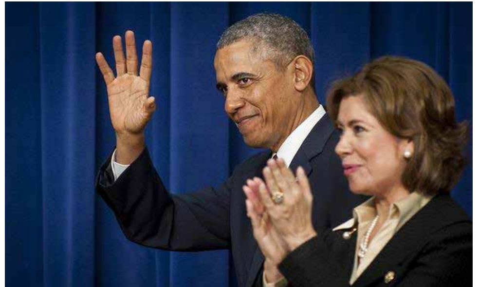
Maria Contreras-Sweet, President Barack Obama's nominee to head the Small Business Administration, still hasn't been confirmed by the Senate.